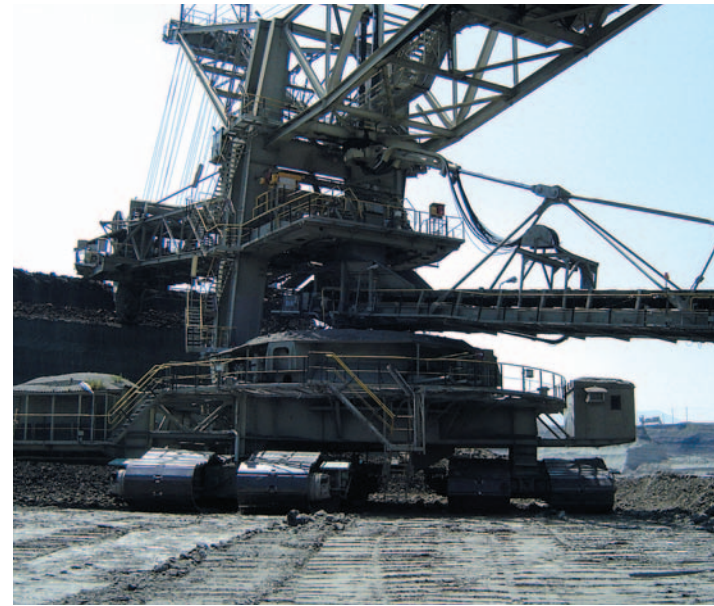
Bucket wheel excavator with conveyor belt

pression devices that had been used in the past, from practically every available supplier in the market, had all failed leaving the coal mine unprotected for a period of years.