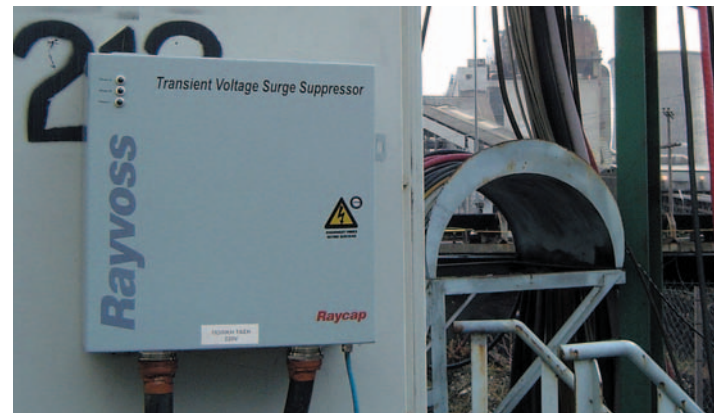
Rayvoss installed on a conveyor belt

The use of Rayvoss in Megalopolis resulted in the continuous and maintenance-free operation of the mine. The net present value (NPV) of the savings realized for a period of ten years will exceed US $4,800,000! The internal rate of return (IRR) for this investment will reach 133% , while after one year from the installation of Rayvoss throughout the mine, the payback period for Rayvoss has proven to be as short as nine months!