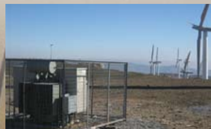
Custom-made external StrikeSorb based upgrade kit

A recent example is the case of Rokas S.A. part of IBERDROLA Group. Having experienced a significant number of transformer failures due to lightning, they decided to conduct field trials of the StrikeSorb technology in their wind farms in North Eastern Greece. Actual installations in 24 turbines for a period of 18 months proved that the problems of failed transformers were completely alleviated, whereas in nearby wind farms transformers kept failing. These initial installations were followed by many more in lightning prone areas. StrikeSorb has become the standard technology for the lightning protection of their wind turbines.